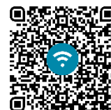
Meet the IHTA@DAGA